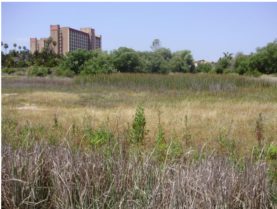
Photograph 4. View west from the culvert located in the northeast portion of the parcel. Typha latifolia associated with the drainage can be seen in the foreground, with the depressional wetland dominated by Scirpus spp. and associated willow stands in the background.