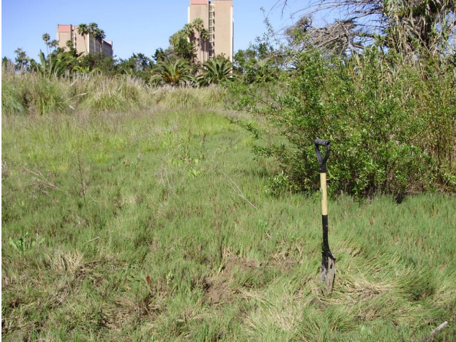
Photograph 3. View west of Sample Point 3. This area receives flows from two swale systems. Note the dense cover of Distichlis spicata .