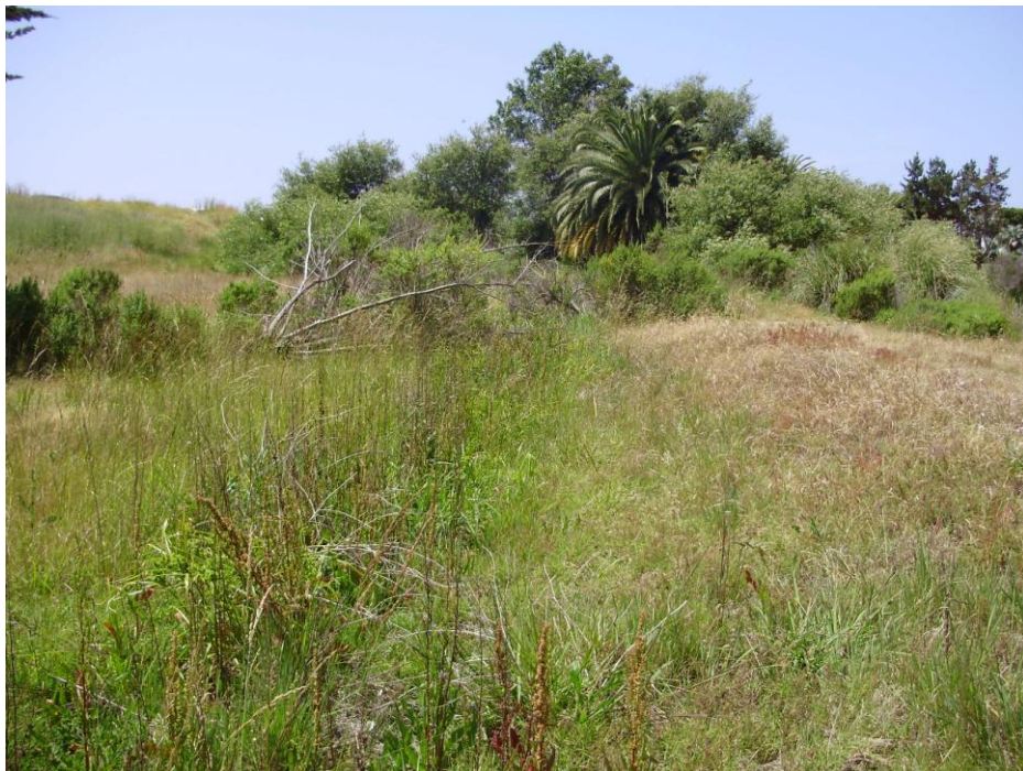
Photograph 2. View southwest of the swale constructed to accommodate flows from the culvert under El Colegio Road. Note the hydrophytic vegetation in the foreground and stand of willows in the background.