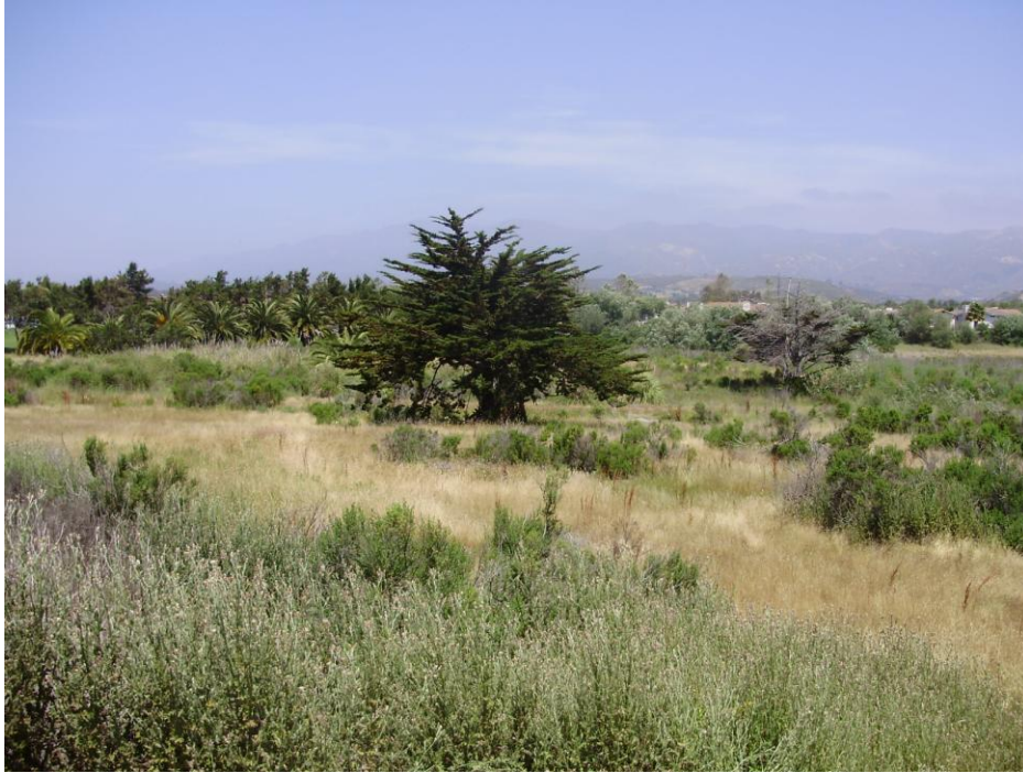
Photograph 1. View north of the study area from El Colegio Road. Vegetation within the site is comprised of a mix of non-native species as well as native wetland and upland plants.