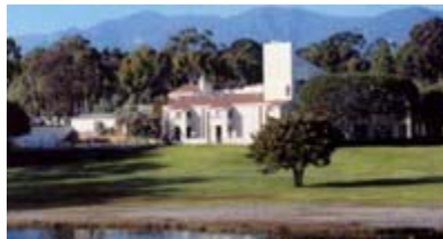
View from Faculty Club overlooking Commencement Green and the Campus Lagoon.

The campus is located within two miles of the Santa Barbara Airport and is easily accessible from Highway 101. It is approximately 10 miles from downtown Santa Barbara. The main campus is bordered by the Pacific Ocean on two sides, with beautiful views of the Santa Ynez Mountains and the ocean.